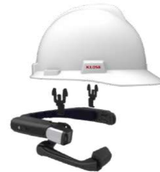
Remote Field Team Assisted Reality & ad-hoc support