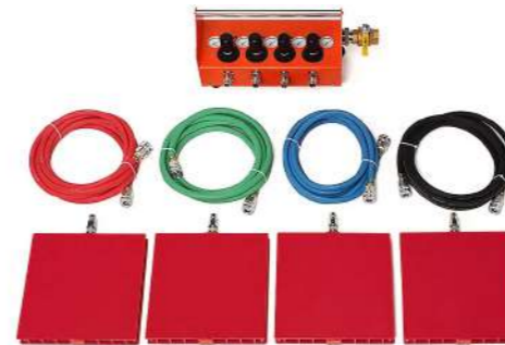
Airpad System Up to 20T capacity