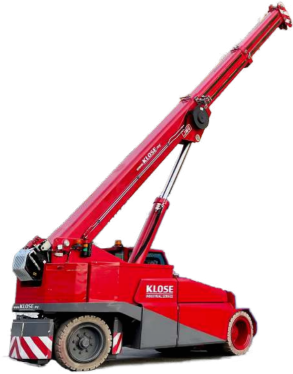
Electric Pick & Carry Crane Up to 25.0T capacity