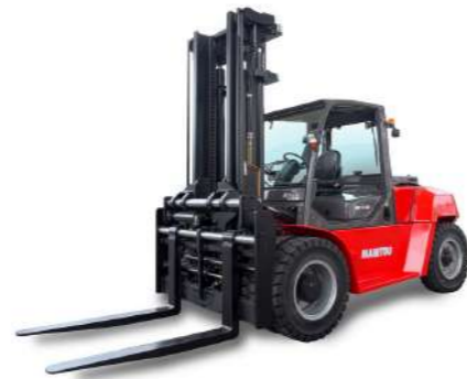
Diesel / LPG Counterbalance Forklift From 3.5 - 12.5T capacity