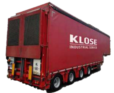
Gigaliner optionally with carry-on Forklift