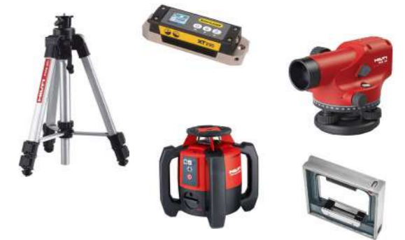
Level / Alignment Tools Up to 0.001mm/m 2 precision