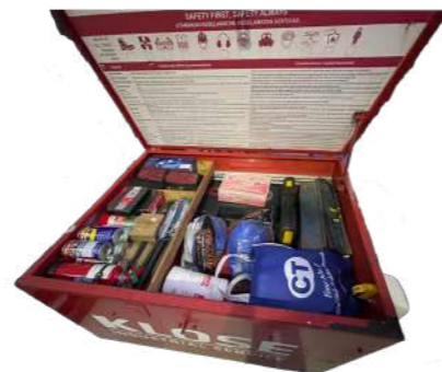
Toolsets Electric / Mechanic / Pneumatic / Hydraulic / ...