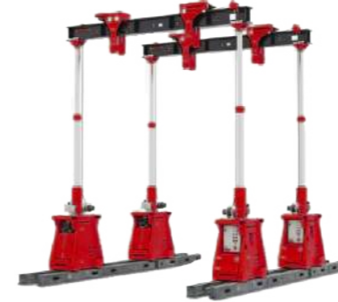
Hydraulic Gantry Electric from 30 - 65T capacity