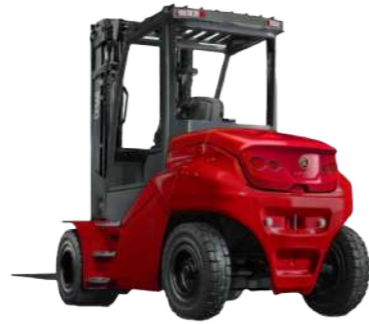
Electric Counterbalance Forklift From 2.5 - 10.5T capacity