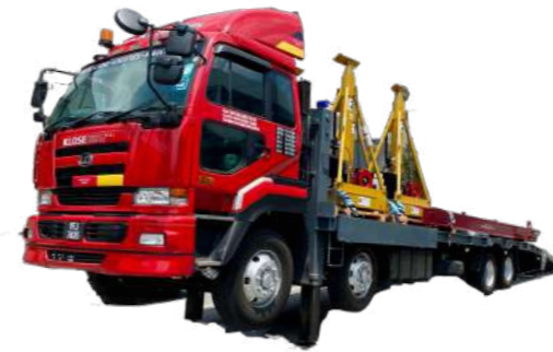
Selfloader RoRo transport up to 20T