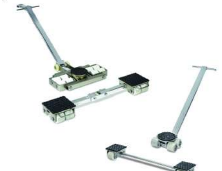
Cleanroom Equipment and other special environment tools