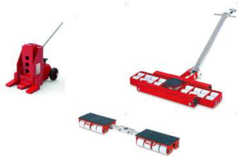
Machine Jacks & Heavy-Duty Skates Steerable / Fixed / Rotational up to 50T ea.