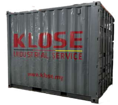
Toolcontainer 10FT / 20FT / 40FT Fully Equipped