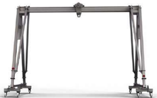
Manual Lifting Frames From 2.5 to 10T capacity